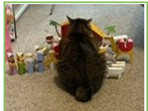
Even cats come to worship at the manger!